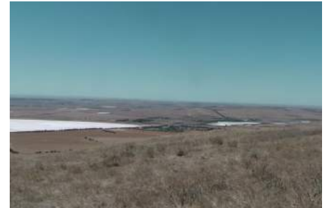
View towards Lochiel & Bumbunga Lake.

than the day before. So we opted out, and headed south to activate Bumbunga Hill, VK5/ SE-015, near Lochiel. Although this is just a 1 pointer, the summit offers spectacular views. Bumbunga Hill is 413 m ASL, and access is across private property.