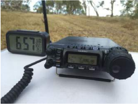
Yaesu FT-857d in action at Mt Magnificent CP.