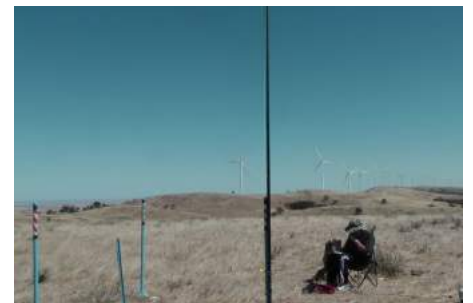
Paul VK5PAS at Bumbunga Hill.

About an hour was spent on the summit, with a total of 53 contacts in the log into VK1, 2, 3, & 5. This included a contact with Tom VK5FTRG who was portable in the Canunda National Park in SE South Australia.