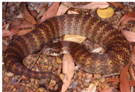
The Death Adder.

I am generally not scared of snakes but this one frightens the s... out of me!