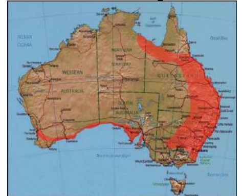
Distribution map of the Death Adder

As a loco driver foreman I would not get off the loco from Coonamia to Whyalla when I worked from Port Augusta.