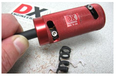
Remove the coaxial cable from the DXE-UT-8213 .