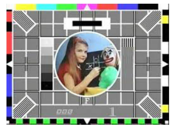
The BBC Test Pattern from the introduction of colour television

That brings us to the end of another instalment until next time take care.