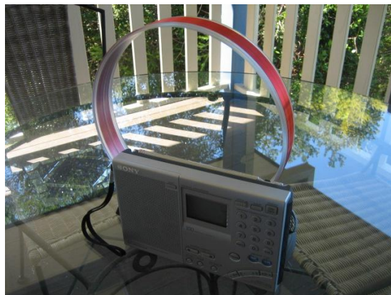
Photo to demonstrate the size of the loop in comparison to the portable Sony

Tuning across the band in between the stations and peaking the "loop tuning control" peaked the reception across the band.