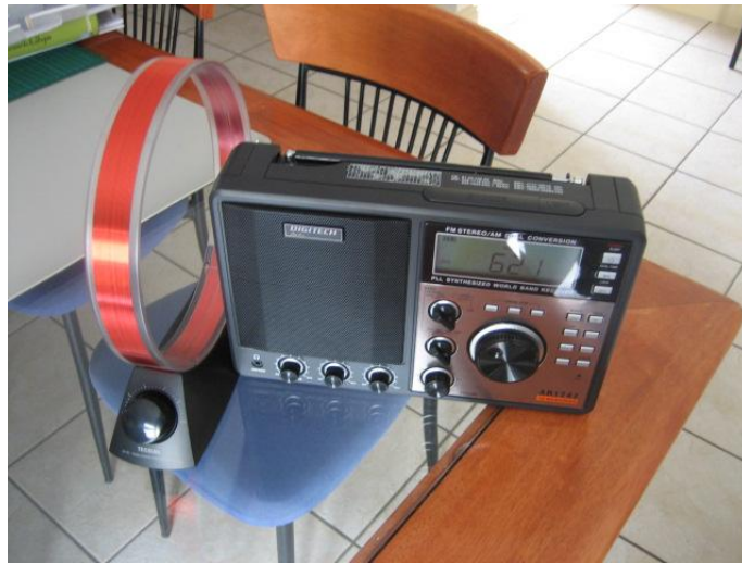
Jaycar AR-1747 AM/FM Shortwave radio with the Loop in action

By far the best performance was with the loop as shown in the photo below.