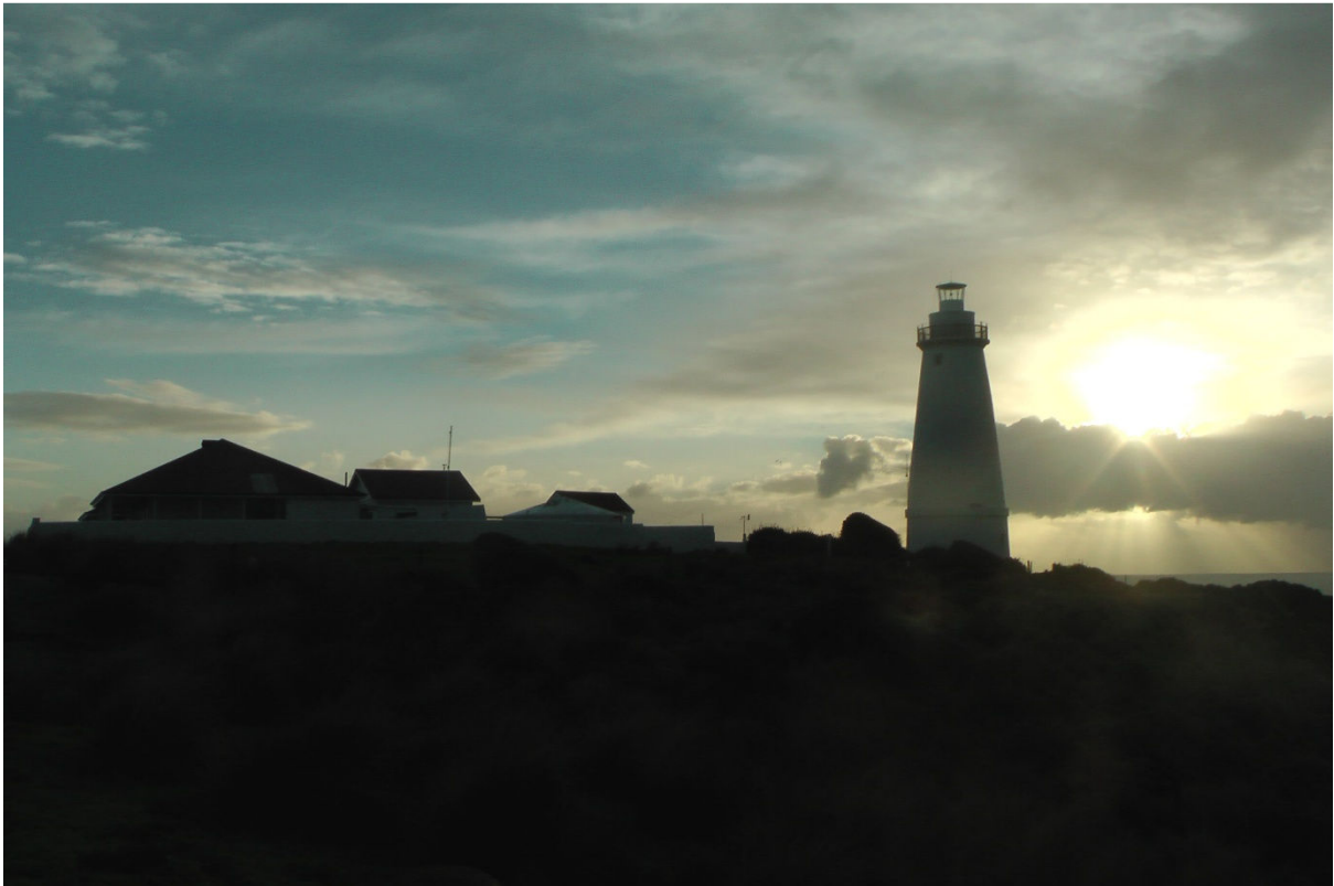
7. Cape Willoughby Lighthouse where VK5BAR operated from.

A full list of statistics is on the WIA RD website in PDF format. Soapbox comments have been copied and pasted from logs and emails, and are also available.