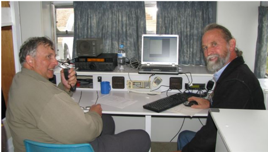
VK2ZHE and VK1ZRE

Taking Point Lighthouse, Port Macquarie.