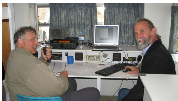
6. VK2ZHE and VK1ZRE operating VK2BOR