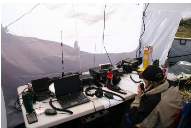
3. Inside VK6FMON's tent.

The top 3 Foundation licences were VK6FMON 448 (QRP PH), VK4FAKE 423 (SOPH), and VK6FDGB 223 (QRP PH)