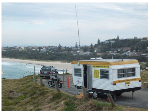
4. ORARC caravan at Tacking Point for VK2BOR