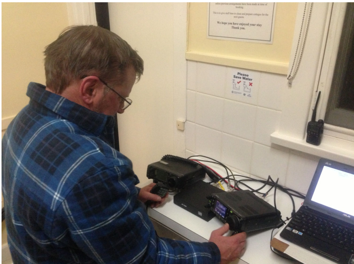
VK5ATW operating SSB