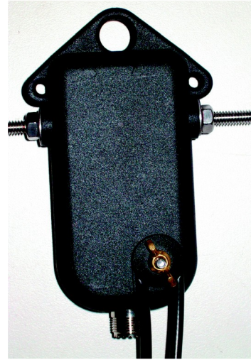
Above: Bushcomm Balun showing coaxial strain relief feature****