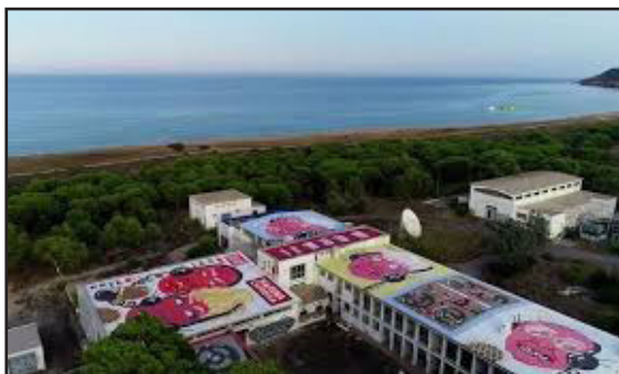
The freshly painted Radio Liberty building