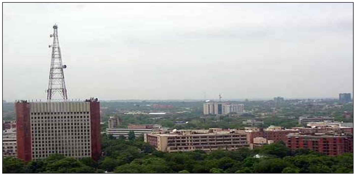
All India Radio headquarters in New Delhi