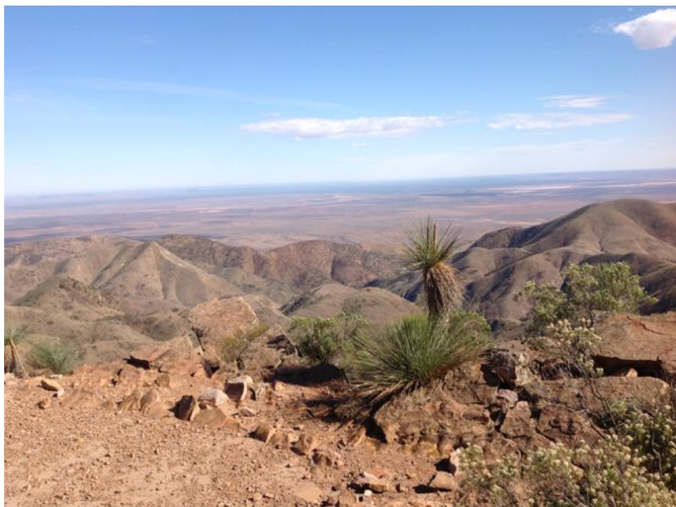
SOTA, VK5 PARKS AWARD, WWFF, PORTABLE, QRP, PEDESTRIAN MOBILE

Welcome to the first edition of ' Out and about in VK5 '.