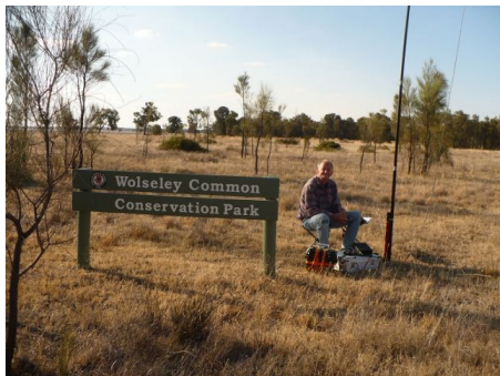
Greg VK5ZGY operating at the Wolsley Common Conservation Park in the South East (Photo courtesy of Col VK5HCF).

In that time, over 100 different parks have been activated across the State. Nearly 130 award certificates have been issued to hams in VK2, VK3, VK5, VK6, & ZL.