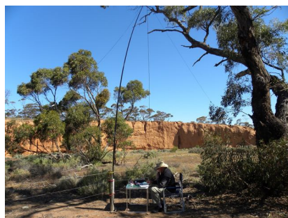
John VK5BJE operating from the Red Banks Conservation Park (Photo courtesy of John VK5BJE).