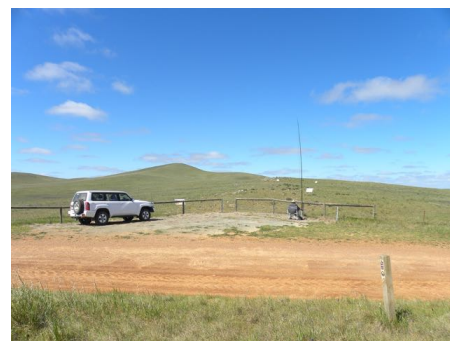
John VK5BJE operating from the Mokota Conservation Park (Photo courtesy of JHohn VK5BJE).